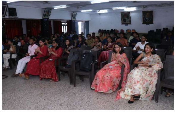
Participants in their traditional dresses