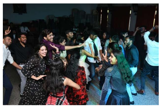
Couple dance by the students