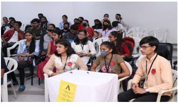
Participating Teams and the audience