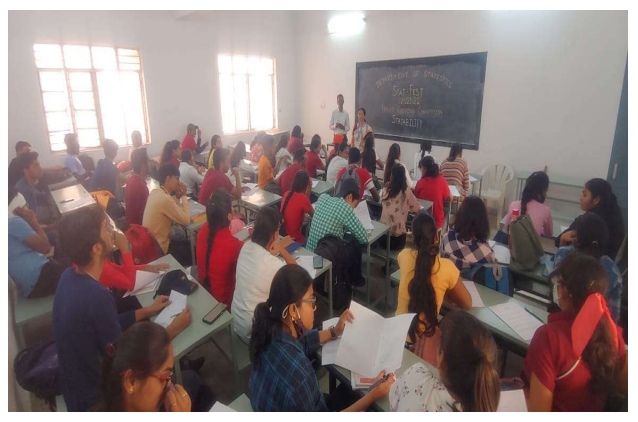
"STATABILITY" Competition in progress