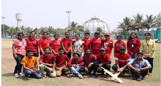
B. Sc. I, II & III players for Cricket Match