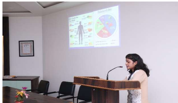
Teachers conducting the session