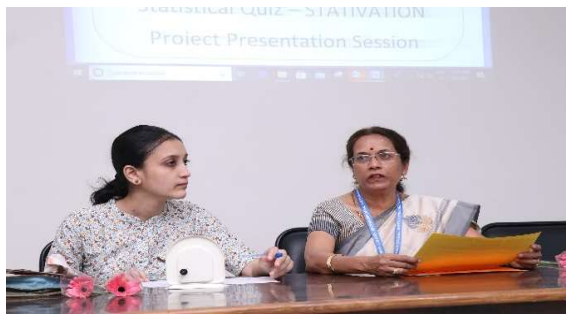
Quiz Competition in progress