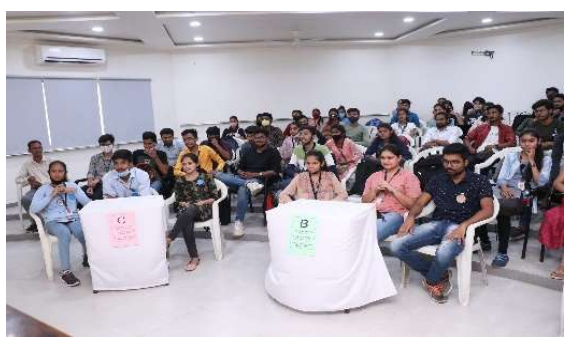
Participating Teams and the audience